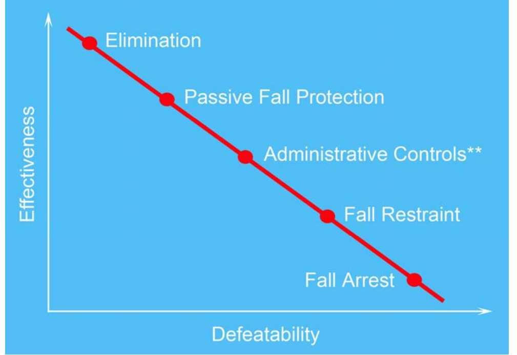
Exhibit 2. The Hierarchy of Controls relates hazard abatement options in terms of effectiveness and ability to be defeated.

Once fall hazards are identified, the evaluation phase focuses on determining the appropriate priorities and measures for abating the hazards. The Hierarchy of Controls (HOC), referenced in Exhibit 2, can play a significant role in evaluating the appropriate abatement methods. Clearly, the goal is to select the most effective solution that is the least likely to be defeated within the physical environment.