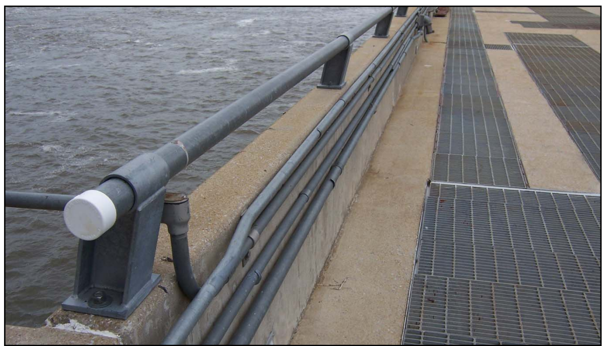
Exhibit 2. A primary focus for USACE is for initial design to account for fall protection measures. This wall required retrofitting with a handrail since it was not tall enough to be compliant.