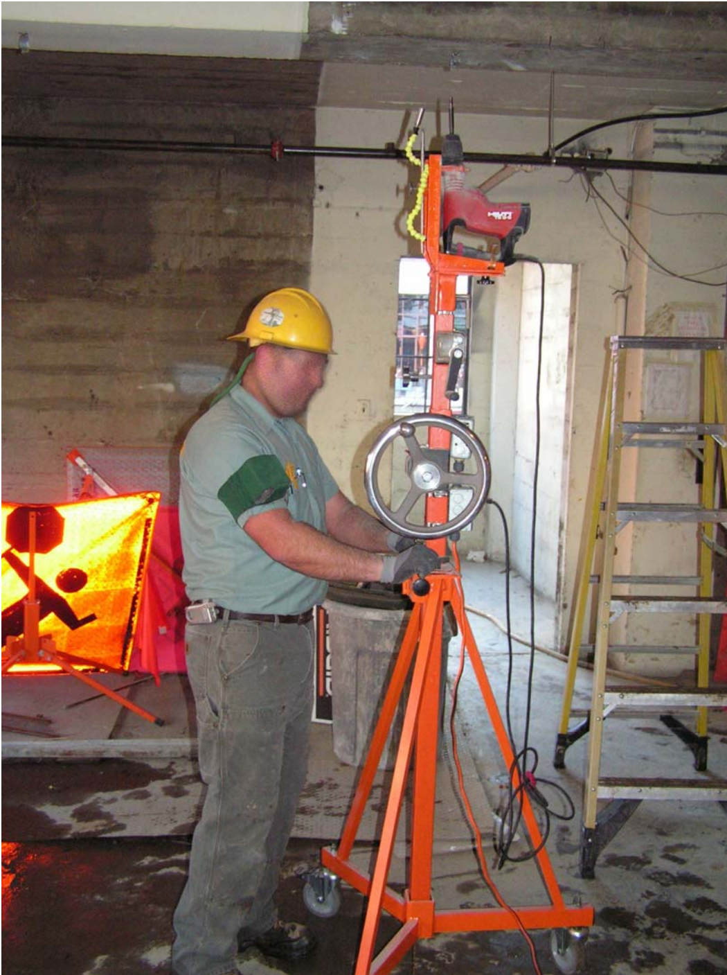
Figure 1. Final device design for overhead drilling. Large crank wheel is for advancing the drill and saddle column to the ceiling using a linear gear. The drill saddle tilts to easily change bits and adjust depth stop. The column adjusts to vertical (where operator's hands are) so that drilling marks can be made on the floor instead of the ceiling. Large locking castors make it easier to move the device over dirty floors.