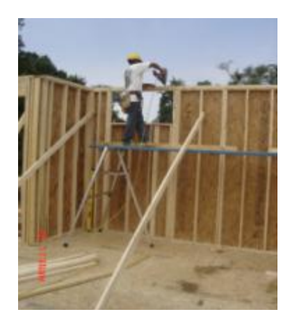
Exhibit 10. Framer working off of horse scaffold tying first floor walls together

Walls can be raised using a self-retracting line and harness with anchor points installed at the feet (shown in Exhibit 11). Materials need to be properly staged to facilitate moving the walls to the proper location. Additional anchor points may be needed in order to facilitate material handling issues and avoid swing fall hazards.