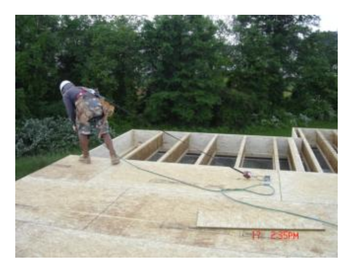
Exhibit 8. Worker using PFAS during installation of floor sheathing

Another practice that was implemented was partially backfilling leaving 39 inches from the top of the basement walls to the ground (shown in exhibit 7). The basement wall acts as a guardrail preventing falls into the basement. This protects framers installing the sill plate, floor joists and sheathing. The excavator would come back after the house was framed to complete the backfill.