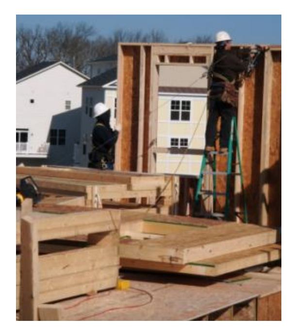
Exhibit 11. Framers installing second floor walls using self-retracting lines and anchor points installed on floor.