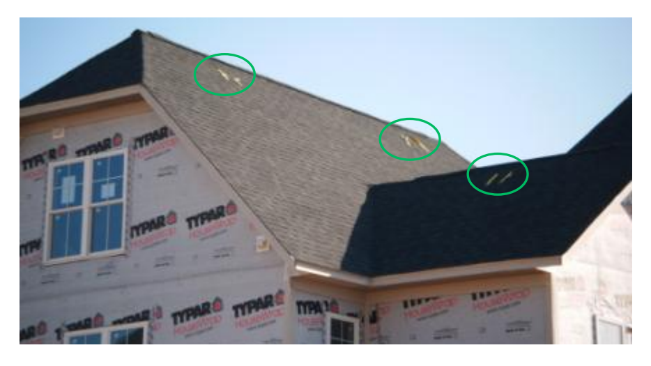
Exhibit 1. Permanent roof anchors installed for trades to use.

Winchester Homes is one of five companies that is part of the Weyerhaeuser Real Estate Companies (WRECO) and builds homes in Maryland and Virginia. Winchester Homes both develops land and buys finished lots to build single-family homes and town homes. Using the "Your Home Your Way" process buyers can modify the home at will. Therefore Winchester seldom builds the same house twice. Besides options and finishes, major structural changes are commonly conducted on base type homes. Over 100 sub contractors are used to complete over 100 building phases. In 2007, the WRECO management team started the implementation of fall protection practices that met or exceeded Sub Part M, phasing out practices that met the OSHA interim fall protection guidelines (OSHA STD 03-00-001). Permanent roof anchor points have been installed on all Winchester Homes sites for over 8 years (shown in Exhibit 1).