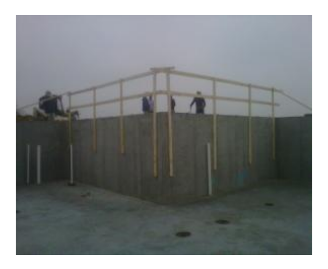
Exhibit 4. Guard rails installed on basement walls

2x4 lumber is used to construct guardrails and attached to the basement walls. These guardrails will serve as fall protection for anybody that walks up to the house near the garage area. See Exhibit 4 for details.