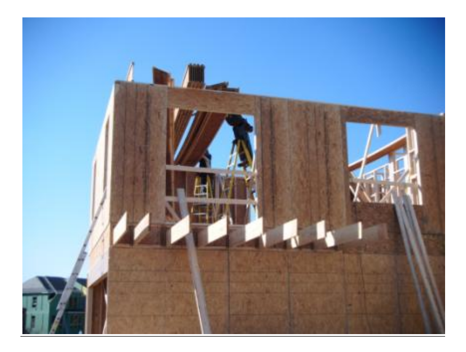
Exhibit 12. Framers installing second floor joists from ladders.