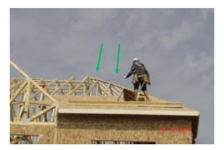
Exhibit 17. Worker sheathing roof using PFAS

Once all of the trusses are set and braced the roof sheathing process starts. Permanent anchor points are then installed in each roof plane. Depending on the size of the home more than one anchor point may be installed on the roof plane (shown in Exhibit 1). The worker hooks in to the permanent points with a retractable line and harness and continues sheathing the roof (shown in Exhibit 17). Any additional work conducted on the roof can be done using the permanent anchor points and PFAS.