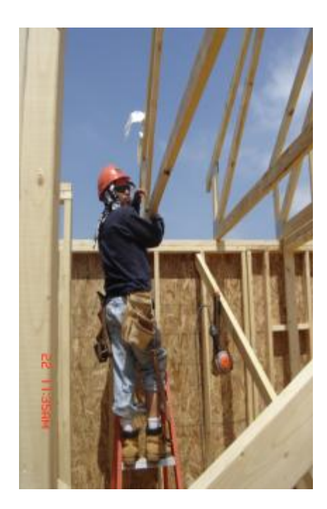
Exhibit 15. Worker working off of ladder while installing trusses.