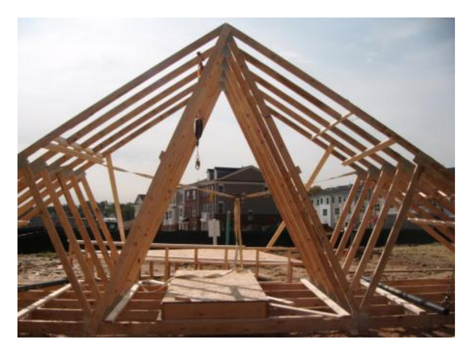
Exhibit 13. Braced trusses with temporary anchor point installed and self-retracting line.