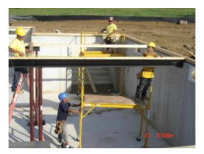
Exhibit 5. Workers setting sill plate on basement walls from ladders and mobile scaffold

The practice of walking basement walls and setting the sill plate and floor joists was eliminated. Framers can work from ladders or scaffolds to complete this task (shown in Exhibit 5 and 6)