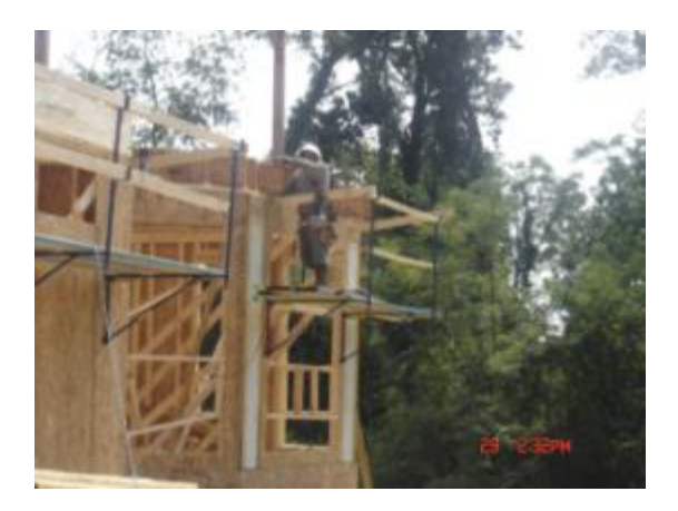
Exhibit 9. Framer working off of carpenter bracket scaffold installing second floor joists

When a walk out basement condition exists there will be a fall hazard greater than six feet from the edge of the first floor, a retractable line, harness and anchor point installed on the floor protects the worker from falls over the edge and falls between floor joists while sheathing the floors (shown in Exhibit 8).