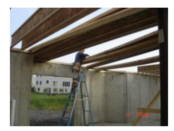
Exhibit 6. Framer working off of a ladder installing first floor joists.