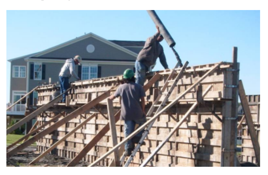
Exhibit 3. Concrete workers working off of bracket scaffold while pouring basement walls.