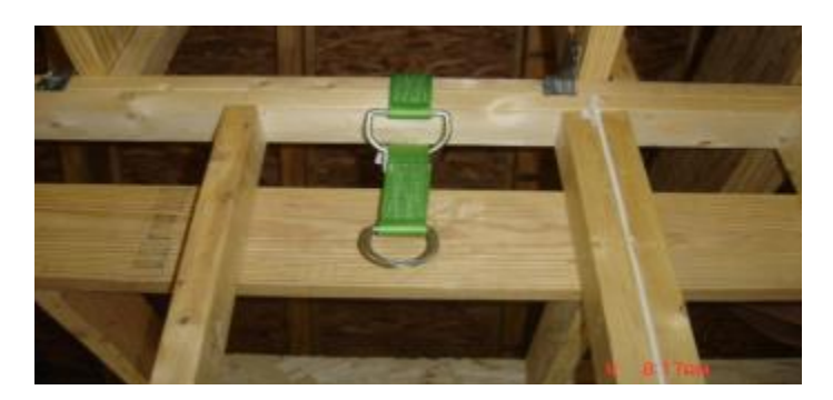
Exhibit 18. Anchor strap installed on double top plate of interior wall

The following are the two main concerns related to the use of temporary anchor points for interior work: strength of the structure where the anchor point will be attached and swing hazards. Attaching anchor straps to a single 2x4 will not meet the OSHA 5000 lbs requirements. A qualified worker needs to make a decision where to install the temporary anchor point. Multiple anchor points may be needed to prevent swing fall hazards.