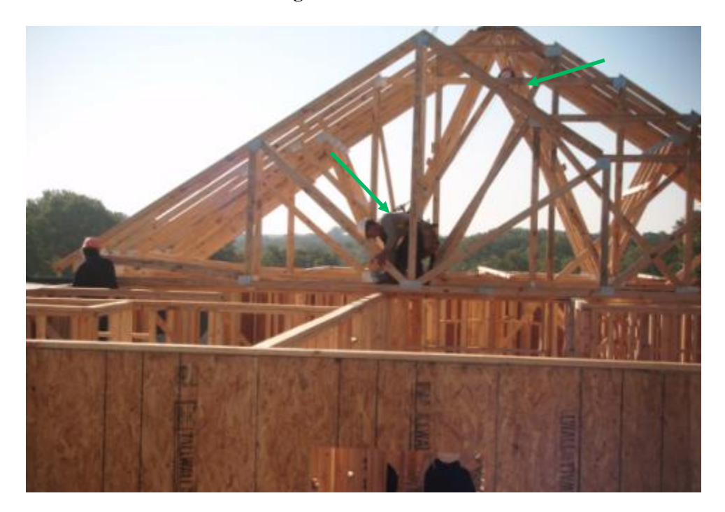
Exhibit 16. Worker using self retracting line and anchor point installed in trusses to set trusses