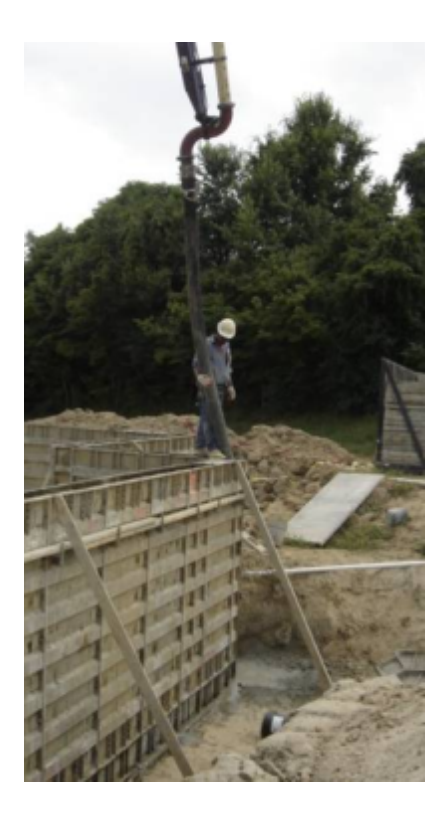
Exhibit 2. Concrete worker walking forms while pouring basement walls.