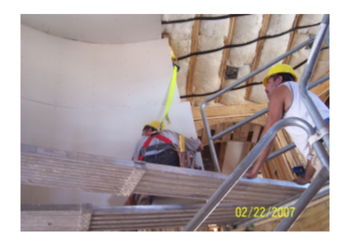
Exhibit 19. Dry wall hangers using PFAS with retractable lines in stairway area.