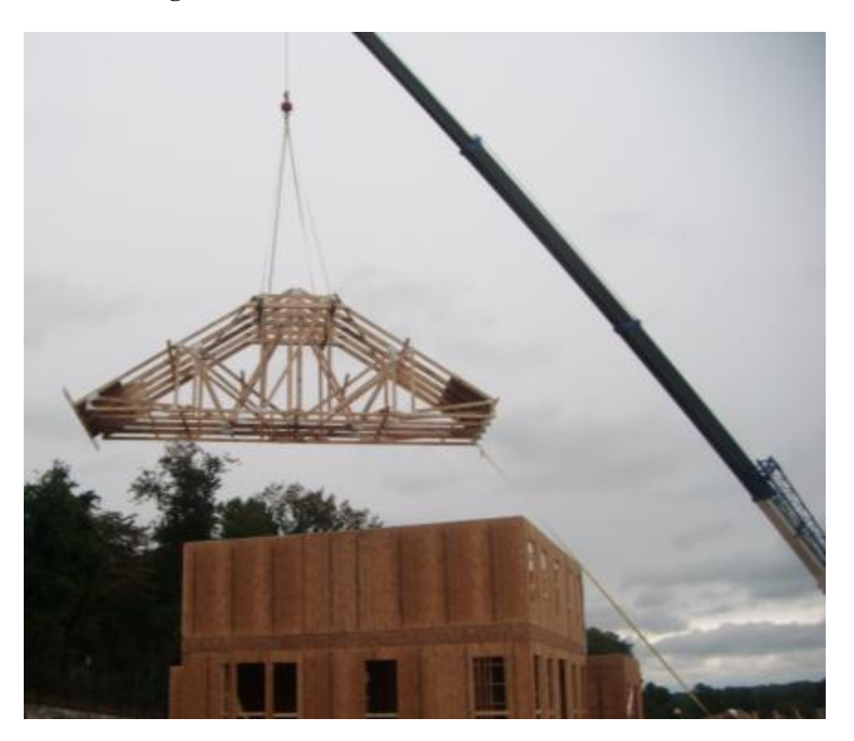
Exhibit 14. Braced trusses lifted by crane