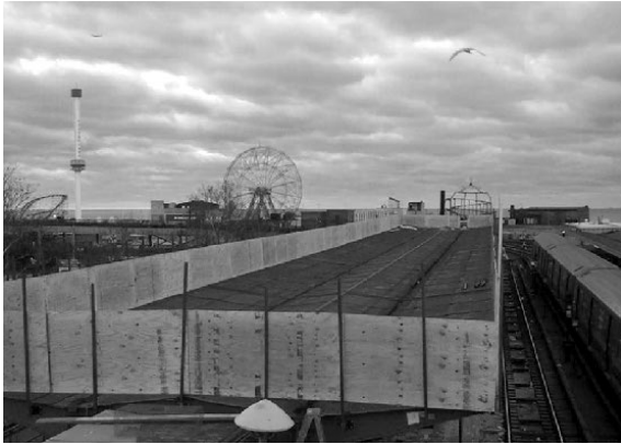
Photo 3: With the envelope in place above the canopy, the platform was able to remain open with normal rider activity while asbestos abatement work occurred directly overhead.

the third rail was discontinued and train service to the tracks nearest the platform consequently removed from service. This required significant advanced planning in order to determine which weekend would cause the least amount of service disruption.