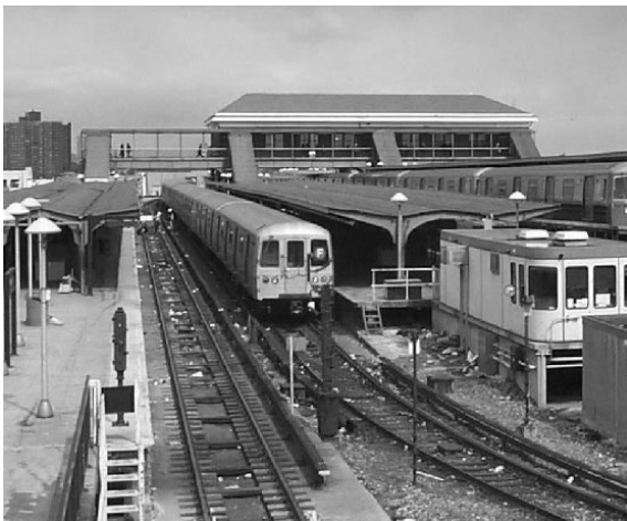
Photos 1 and 2: The Stillwell Avenue train terminal was built between 1915 and 1919 as part of the Brooklyn-Manhattan Transit subway system; it is an elevated station located on property owned by MTA. The train serves as a primary connection to local attractions such as the shore amusement parks, beaches, parks and a nearby minor league baseball stadium.

The abatement plan devised focused on completing the remediation in as many locations as possible throughout the facility within the critical path of the reconstruction, while maximizing activities during off-peak train service times and the limited train service disruptions that had been planned. After