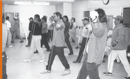
(Clockwise from top left) Photo 1: Flexibility and strength are required for safe lifting. Which lifter is at risk for injury? Photo 2: Fitness sticks increase challenge and variety, and improve range of motion. Photo 3: Stretch cords add variety and challenge, and help improve basic, balanced strength.

workers and road crews. Using the proven processes implemented at offshore oil platforms, they conducted employee orientations, baseline measurements and quarterly flexibility tests for individuals and teams. This provided progressive feedback and motivation to improve. Stretches were implemented in four phases, each adding more challenge and variety, including balance, strength and coordination moves. Two new elements were added to minimize boredom. Fitness sticks sparked interest and increased challenge, and resistance cords promoted balanced strength (Photos 2 and 3). Qualified fitness professionals monitored the process and coached individuals and teams to higher performance.