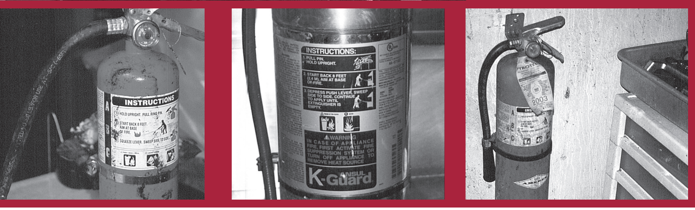
Photo 6 (below): ABC extinguisher found in a commercial kitchen. Employee training should stress the negative impact of using an ABC portable on oil and grease fires.

Photo 5 (below, middle): Class K extinguisher. Fixed automatic wet chemical systems are the best extinguishing method for oil and grease fires. Class K portable extinguishers are recommended as a secondary (or backup) extinguishing method.