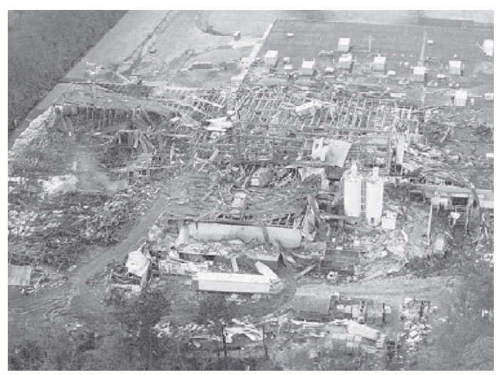
Photo 1: Dust explosion killed six and destroyed West Pharmaceutical plant in Kinston, NC, in January 2003. Photo 2: Dust explosion destroyed production area at CTA Acoustics and caused seven fatalities.