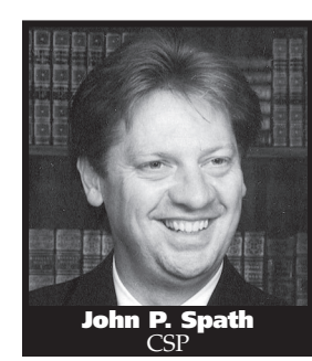
Candidates for Vice President, Practices & Standards