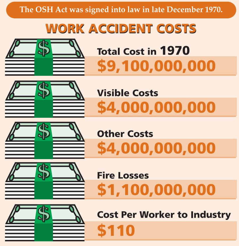
*Visible costs include wage losses of $1,800,000,000, insurance administrative costs of $1,300,000,000 and medical costs of $900,000,000.

*Other costs include the money value of time lost by workers other than those with disabling injuries who are directly or indirectly involved in accidents. Also included is time required to investigate accidents and generate related reports.