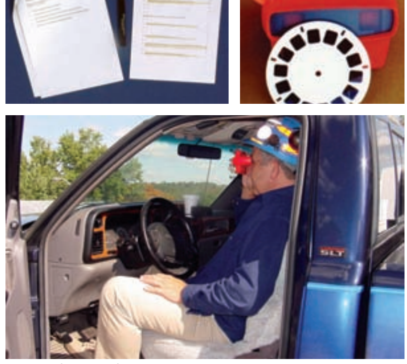
Clockwise from top left: Photo 2: Invisible ink training exercise example. Photo 3: 3-D viewer and slide reel. Photo 4: Driller looks at 3-D reel before his shift.

A first draft of DRI and six demo 3-D slide reels were prepared then authenticated by various indus-