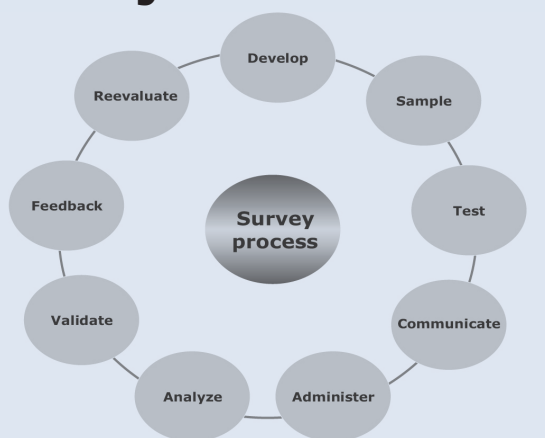
Figure 2 Safety Perception Survey Process

The survey process has nine key steps. By following these steps, an organization can create a survey that will help it create more positive safety perceptions and more positive safety attitudes.