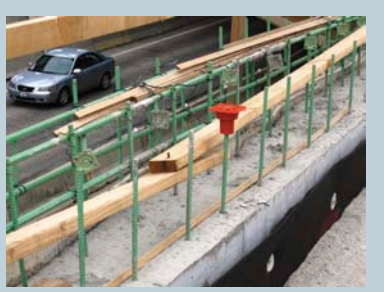
Photo 3 (left): Identified fall exposure to employees from permanent hole. Photo 4 (right): Exposure to unprotected rebar, presenting an impalement hazard.

·asked for guardrails from the controlling employer.