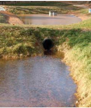
Completed pond in the background and forebay has helped the club conserve water.

ter quality. Chemicals can be used and are relatively inexpensive but do require periodic applications.