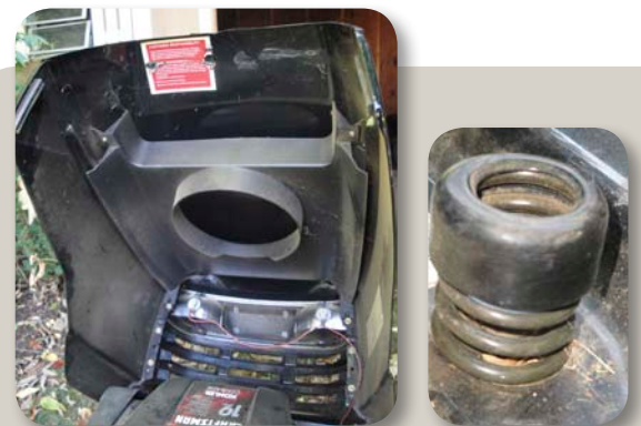
Photo 4 (left): Metal housings vibrate and generate noise such as this example. Plastic or fiberglass housings provide more internal damping and reduce noise propagation. Photo 5 (right): Springs and rubber material can be used to isolate and dampen vibrating parts.

Many employees work all day outside continually operating lawn care equipment. These workers' personal noise exposure can conceivably reach or exceed the ACGIH TLV 82 dBA based on an 8-hour exposure. Workers' exposure should be determined through noise dosimetry sampling and, based on the results, a hearing conservation program may be warranted. Individuals who work for extended periods riding tractors and operating lawn care equipment should be trained in the use of hearing protection and encouraged to use earplugs or earmuffs while working.