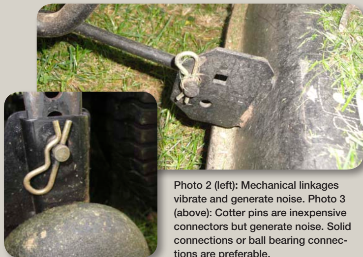
Photo 2 (left): Mechanical linkages vibrate and generate noise. Photo 3 (above): Cotter pins are inexpensive connectors but generate noise. Solid connections or ball bearing connections are preferable.

Mower decks, engine housings and mechanical linkages are parts that can vibrate and propagate noise (Photos 2, 3). Various options to incorporate into new lawn tractors to reduce noise radiation include the following concepts: