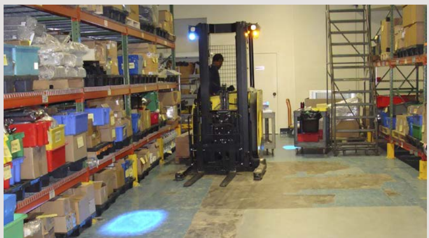
(Counterclockwise from top left) Photo 1: Single forward-facing blue light installed. Photo 2: Forward- and rear-facing blue lights installed. Photo 3: Red lights installed on each side, with the front blue light visible on the storage rack and the rear blue light visible on the floor (right edge of photo).