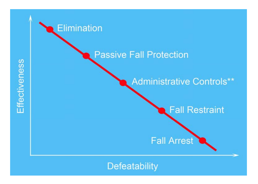
Figure 1. The Hierarchy of Control relates hazard abatement options in terms of effectiveness and ability to be defeated.

Many organizations jump to purchasing fall protection equipment due to its perceived low cost. Although initial costs may be reduced, the potential "hidden costs" and recurring costs associated with equipment can often cost more in the long term. The costs of proper system design, training for personnel and long-term maintenance must be factored into equipment purchasing decisions. In addition, choosing a PPE-centered abatement method without first evaluating other options and involving stakeholders, may cause you to choose a solution with increased residual risk. By not minimizing risk to the full potential, you are not making the most of your investment in fall protection.