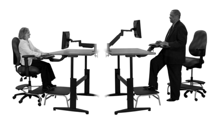
Figure 2. The N-tune workstation is one option to businesses who are looking to provide their employees the opportunity to stand with a seated option. (Neutral Posture, 2007)

One ergonomic solution is to design a workstation that has the ability for a worker to remove themselves from a chair and to work standing up (see Figure 2). The design of this station would have the workstation height at approximately 40 inches, or elbow rest height of the employee. All objects would continue to be within a functional reach and the workstation equipped with a keyboard and mouse tray. A footrest would allow for weight transfer, another posture change, to decrease static fatigue. A raised chair would give the employee the option to sit, but with a desk at this height a standing bias is felt.