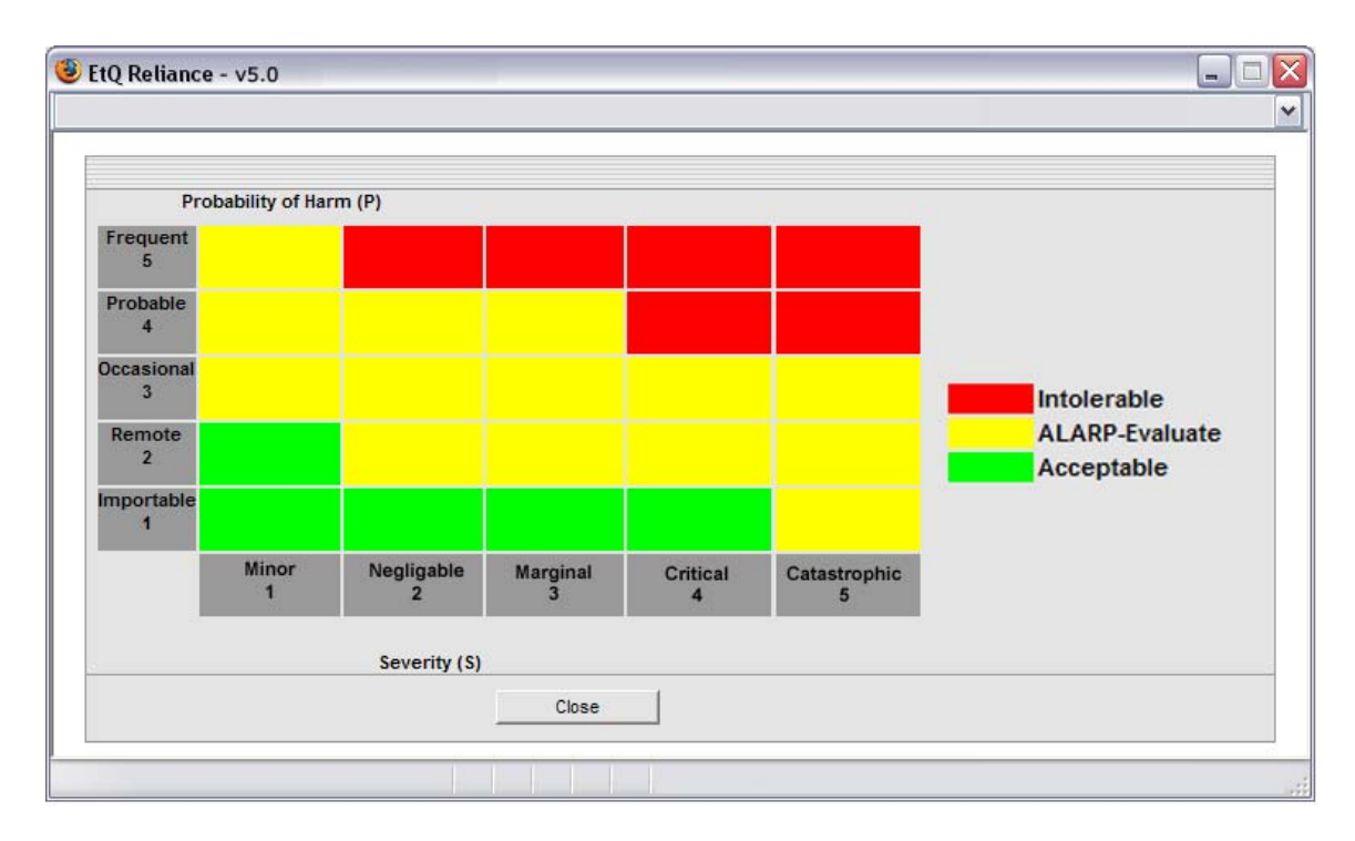
Figure 1. A sample risk matrix seen below takes the severity level and probability level and associates the appropriate risk level for the event.

At this point the CAPA generates the action plan, which is designed to determine the root cause and corrective action of the complaint, much like in any other CAPA process. Where it is different is in the CAPA effectiveness phase in the workflow.