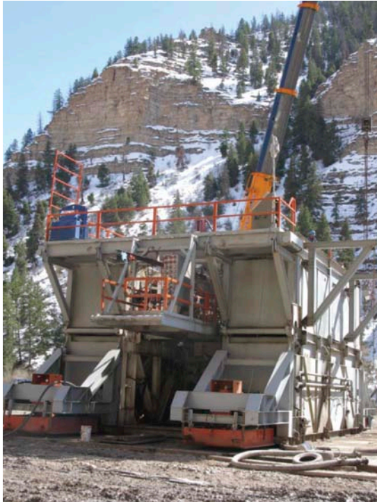
Photo 1: Walking rigs are large land-based rigs used on locations where numerous wells are drilled in a small area.

into distinct fields that are tracked and reported by the Energy Administration Information office of the Department of Energy ( www.eia.doe.gov/oil_gas/rpd/topfields.pdf ). Certain fields were selected as starting points, including the Permian Basin in west Texas, the Piceance Basin in western Colorado, the San Juan Basin in northwest New Mexico, the Barnett Shales in central Texas, the Jonah Fields of northern Colorado, and the TX-LA-MS Salt Province of east Texas and Louisiana. These fields included both natural gas and oil formations, and shallow as well as deep reserves.