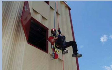
A rescue team member performing refresher training.

It all starts with proper planning and ends well because of this effort. The goal is to be ready and able to rescue a worker who has fallen without ever needing to because the managed comprehensive fall protection program prevented an event from occurring. PS