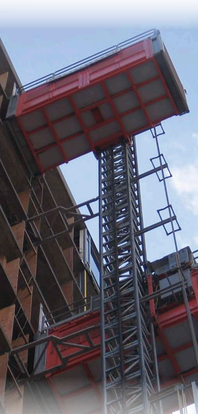
Photo 1. A two-car construction hoist in operation on a residential high-rise.

ANSI/ASSE A10.4-2007 is a national consensus standard titled Safety Requirements for Personnel Hoists and Employee Elevators: American National Standard for Construction and Demolition Operations (ANSI/ASSE, 2007). It applies to the design, construction, installation, operation, inspection, testing, maintenance, alterations and repair of hoists and elevators that 1) are not an integral part of buildings; 2) are installed inside or outside buildings or structures during construction, alteration, demolition or operations; and 3) are used to raise and lower workers and other personnel connected with or related to the structure. These personnel hoists and employee elevators also may be used for transporting materials under specific circumstances defined in the standard, which establishes minimum requirements intended to provide for the safety of those engaged in occupations requiring