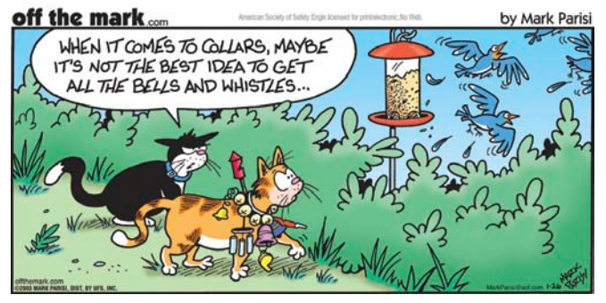
72 ProfessionalSafety NOVEMBER 2013 www.asse.org

"Come on get smart, tune up and start to whistle while you work."